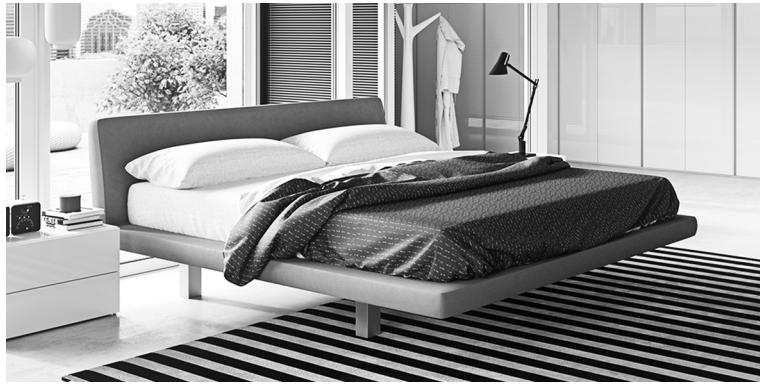
Letto imbottito sfoderabile • Bed with removable cover